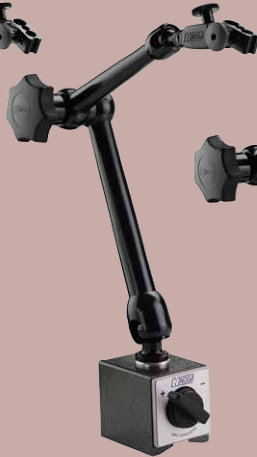
MG71003 Overall arm length 347.50 mm