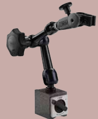
NF61003 Overall arm length 178 mm