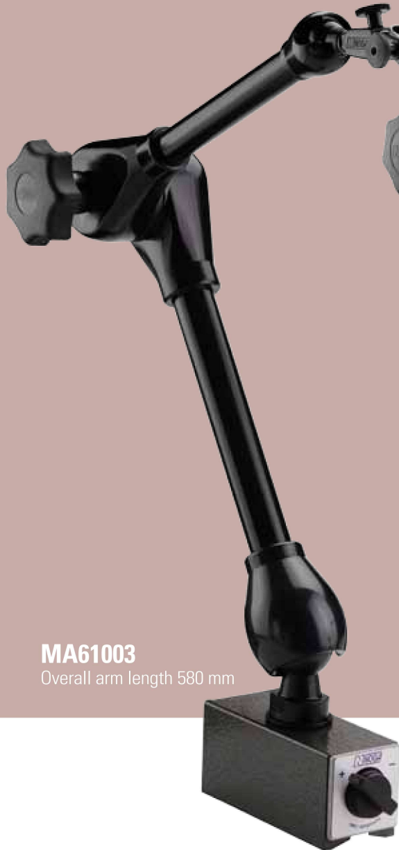
MA61003 Overall arm length 580 mm