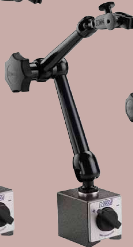
MG61003 Overall arm length 317 mm