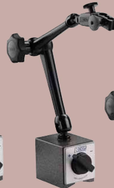
DG61003 Overall arm length 282 mm